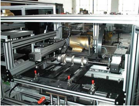
Contour Machining Station

Advent Design's client developed a new ridge vent product for venting buildings with contoured metal roofs. In order to produce the product to specifications in large quantities the client needed to develop a process to efficiently cut the vent material off a web to the various metal panel patterns. Advent Design developed a machining process to reliably cut the material and developed a set of machines to process the web material from raw stock (12" x 250' rolls) to finished product.