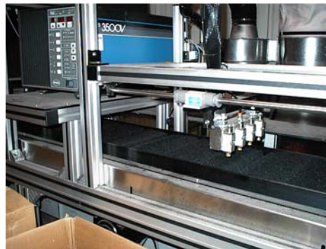
Hot Glue Dispensing